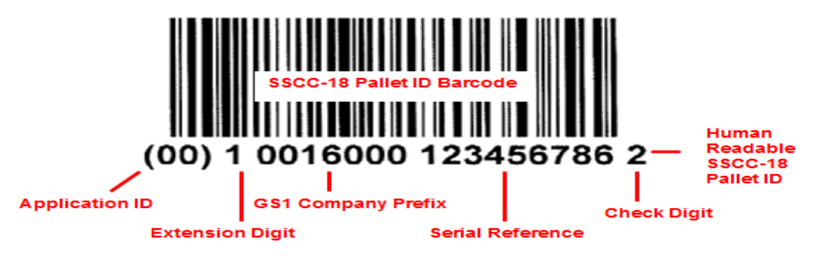
Figure 1. Pallet or tote label with $SCC-18 unique pallet identifier