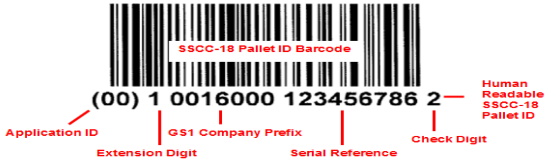
Figure 1. Pallet or tote label with SSCC-18 unique pallet identifier